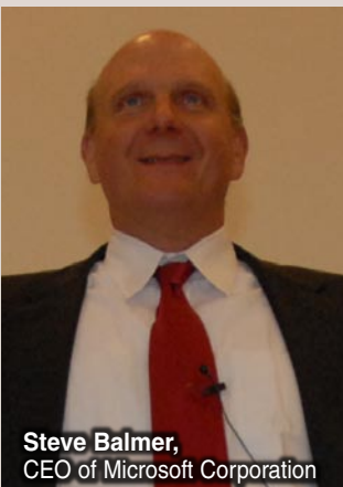
Steve Balmer, CEO of Microsoft Corporation

The international conference European Science and Technology Forum is held by Česká hlava (Czech Mind) in cooperation with the University of Economics in Prague. The objective is to make it possible for the people who influence the future of the entire society to meet. Leading scientists, industrialists, politicians and representatives of academia regularly meet in Prague. The ambition of the project is to create functional and efficient bridges between these elites which often exist too separately and communicate little among them and to offer space for the exchange of ideas and experience indirectly promoting better communication and cohesion of scientific and other research stations with the commercial sector.