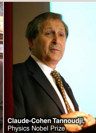
Claude-Cohen Tannoudji, Physics Nobel Prize