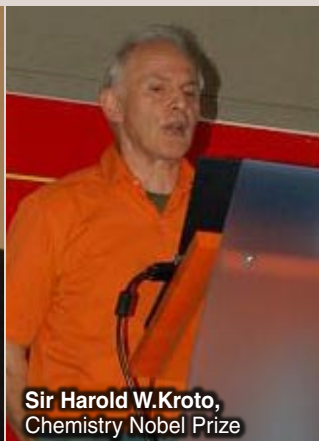
Sir Harold W. Kroto, Chemistry Nobel Prize