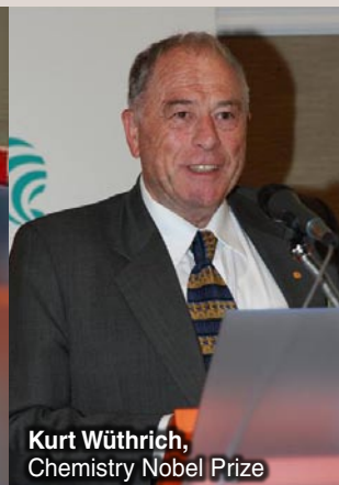
Kurt Wüthrich, Chemistry Nobel Prize