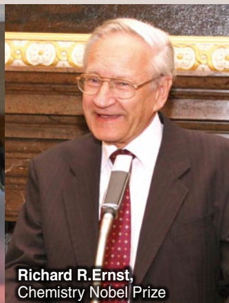
Richard R. Ernst, Chemistry Nobel Prize